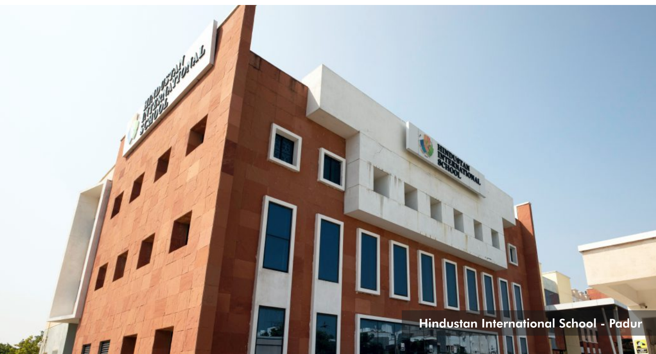
Hindustan International School - Padur