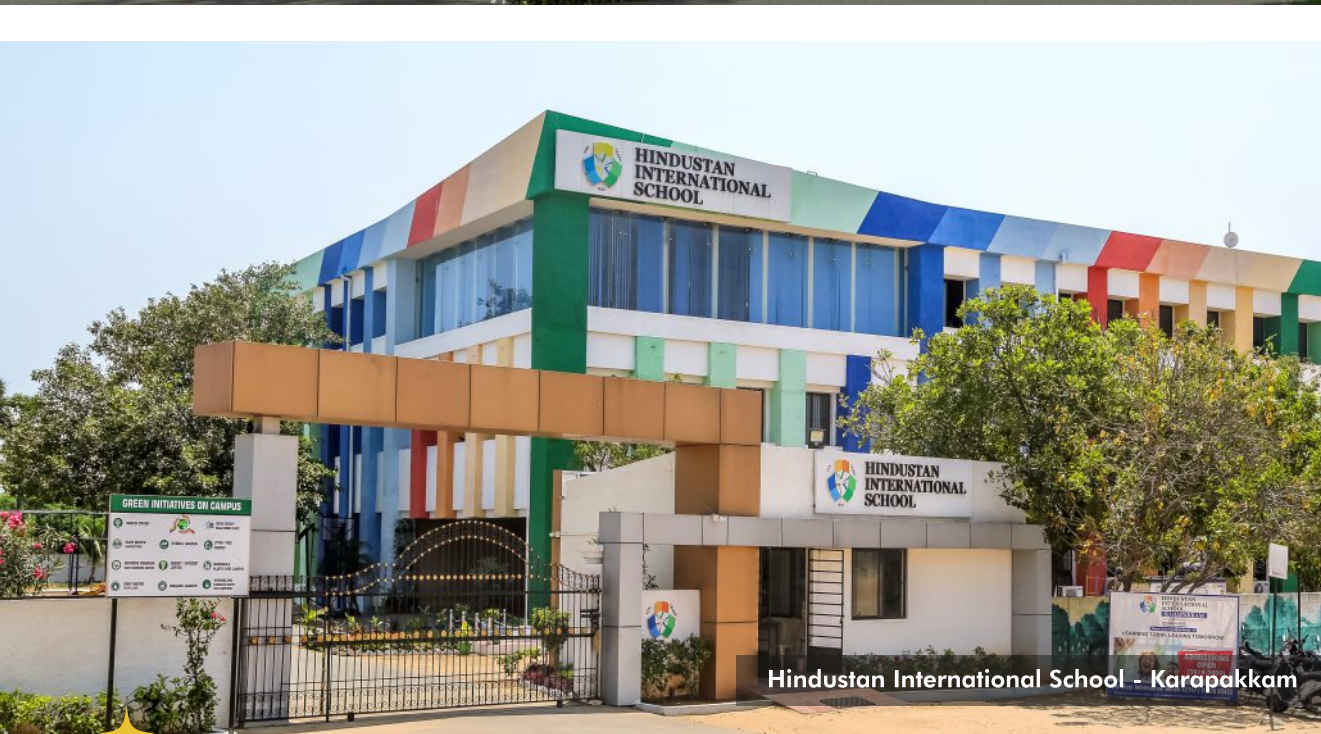
Hindustan International School - Karapakkam