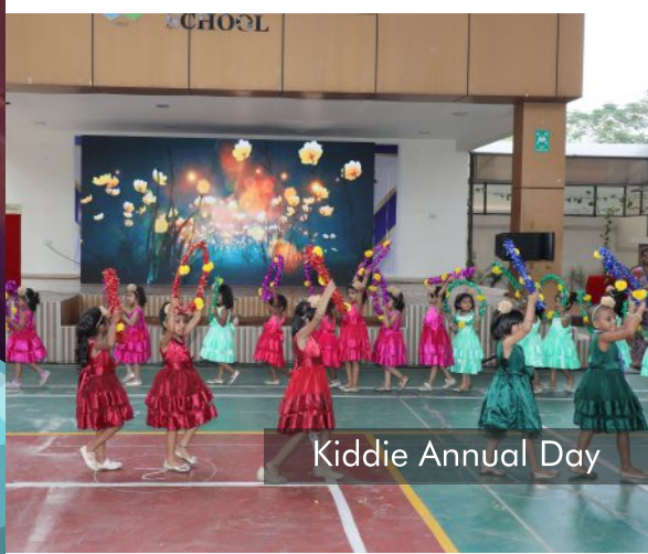
Kiddie Annual Day