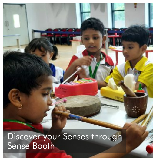
Discover your Senses through Sense Booth