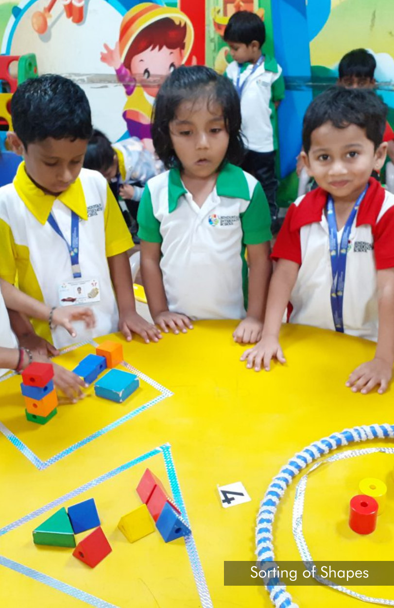
Sorting of Shapes