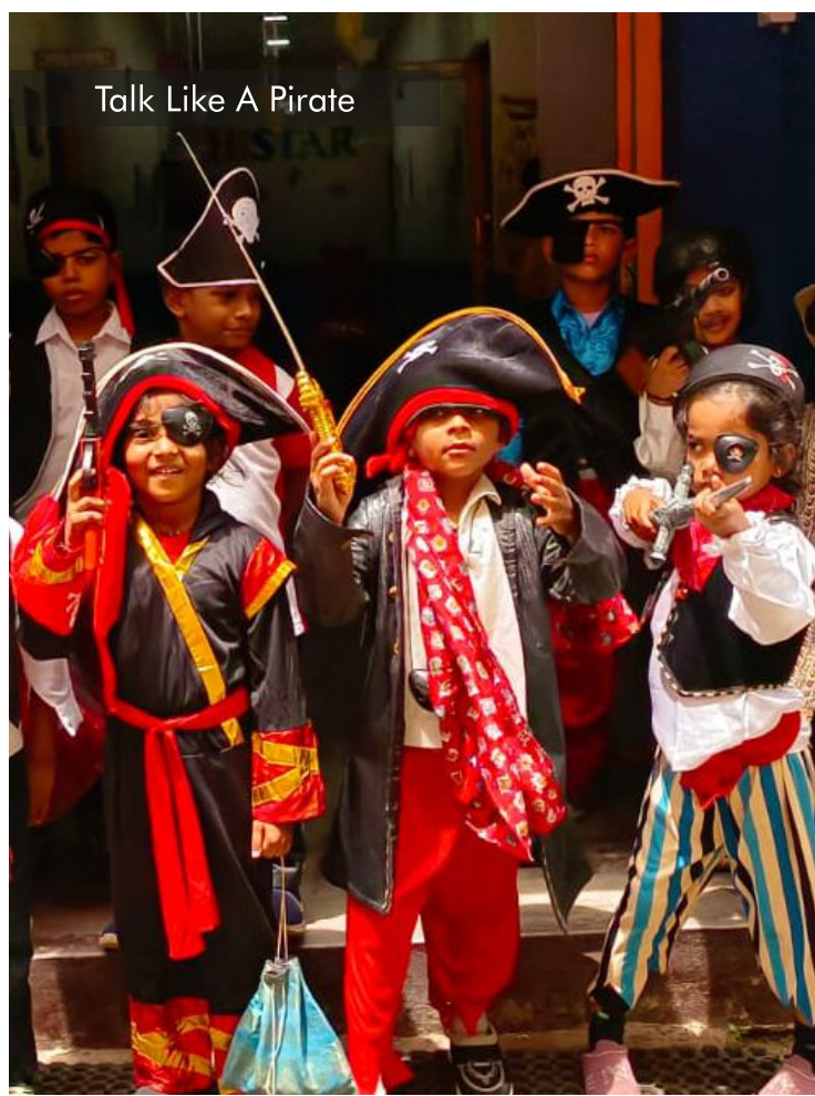
Talk Like A Pirate