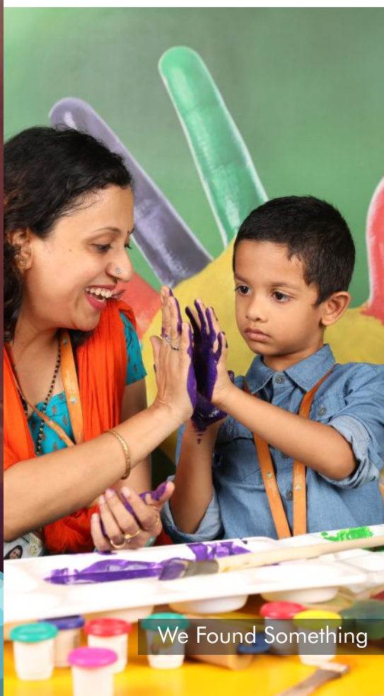
We Found Something