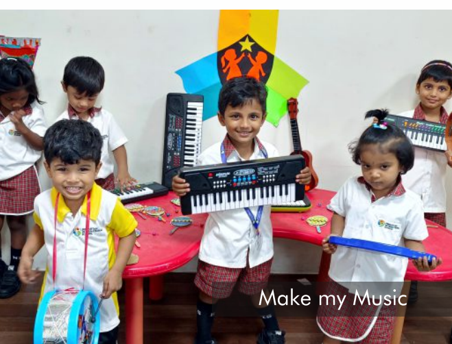
Make my Music