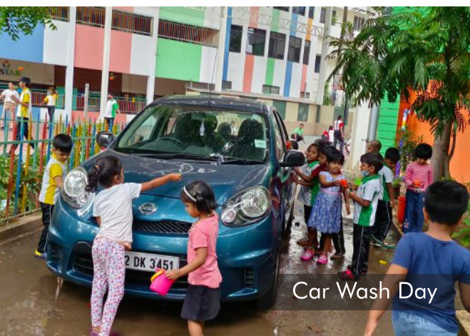
Car Wash Day