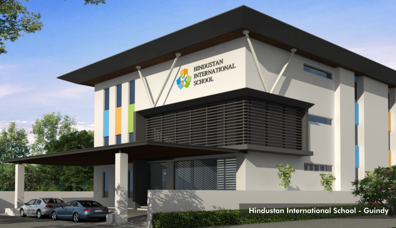
Hindustan International School - Guindy